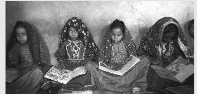
Project Gram Swaraj Sangh (GSS), Gujarat.