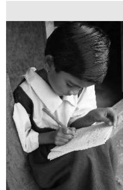
Project KMAGVS, Maharashtra