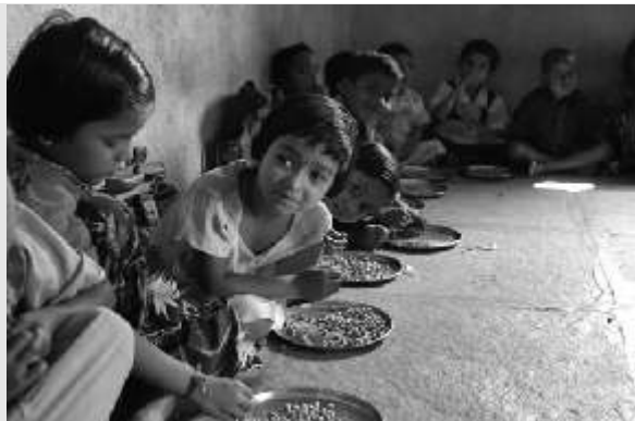
Project KMAGVS, Maharashtra