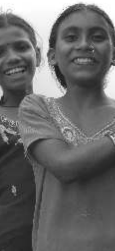
Project KMAGVS, Maharashtra