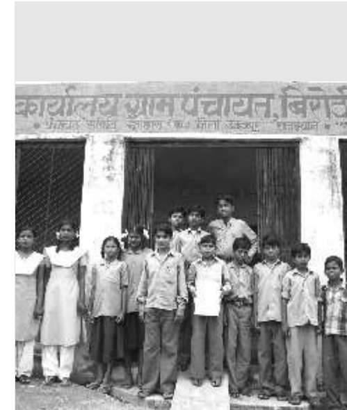
Project Mahan Seva Sansthan (MSS), Rajasthan