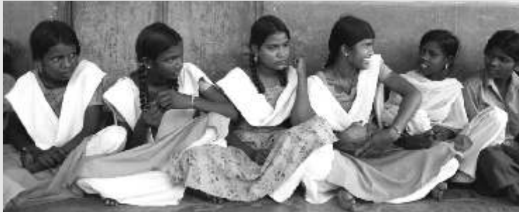
Project Mahan Seva Sansthan (MSS), Rajasthan