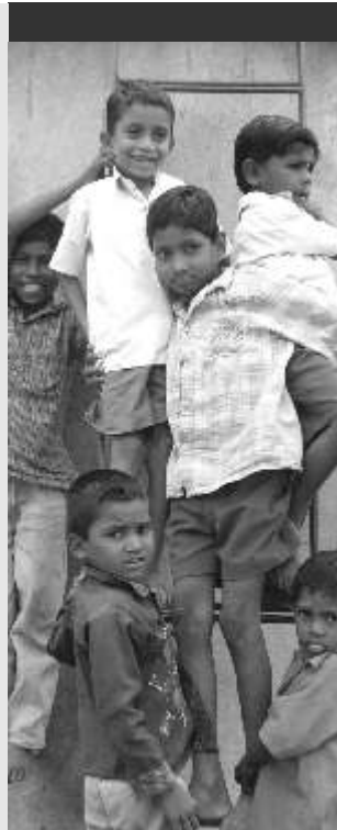
Project SIPRA, Himayatnagar

Number of children provided with education support